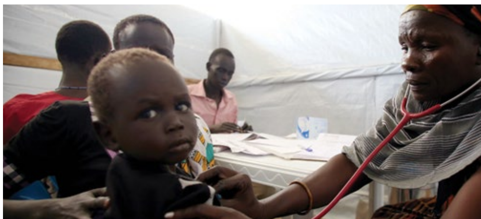
One of two CARE clinics in the Bentiu UN civilian protection area, South Sudan

CARE worked hand-in-hand with local communities, government agencies and civil society partners to help nearly 200,000 people begin their recovery from the disaster, providing emergency shelter, including warm clothes and blankets, seed support, household latrines, and dignity kits.