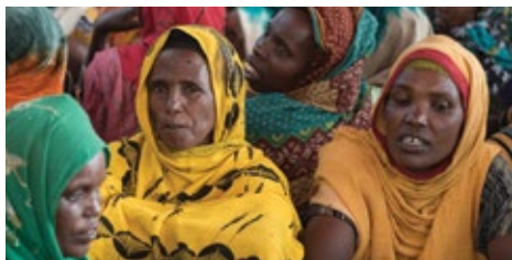
East Hararghe, Ethiopia - discussion with Village Savings and Loan groups and others

92% ♂ ♀ of our projects worked to empower women and promote gender equality through either gender-transformative approaches or gender-sensitive activities.