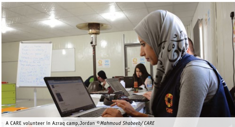
A CARE volunteer in Azraq camp, Jordan

refugees, especially among households headed by women. One third of school-aged children are still out of school, with boys more affected than girls, and many children must work to support their families. Women and adolescent girls continue to be at increased risk of different forms of gender-based violence including child marriage in both public and private spaces.