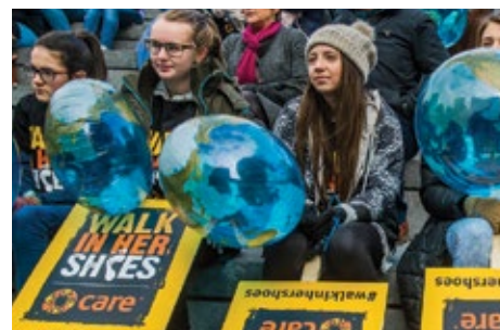
'Walk in Her Shoes' a mother's day march in solidarity with women and girls around the world and in advance of International Women's Day

have benefited from CARE's projects through policy changes, replication of successful programmes by partner organisations and governments, and scaling up of innovations.