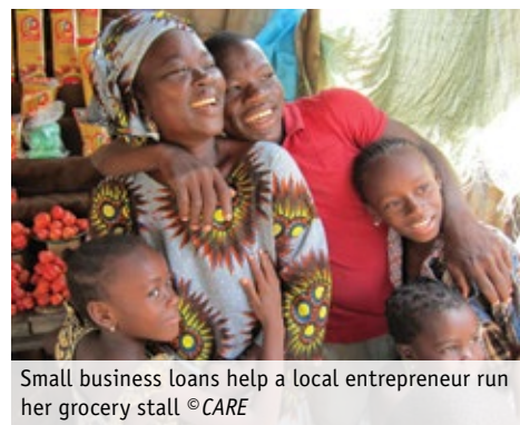
Small business loans help a local entrepreneur run her grocery stall

power, such as governments, traditional leaders and the private sector, to be more responsible, responsive and accountable.