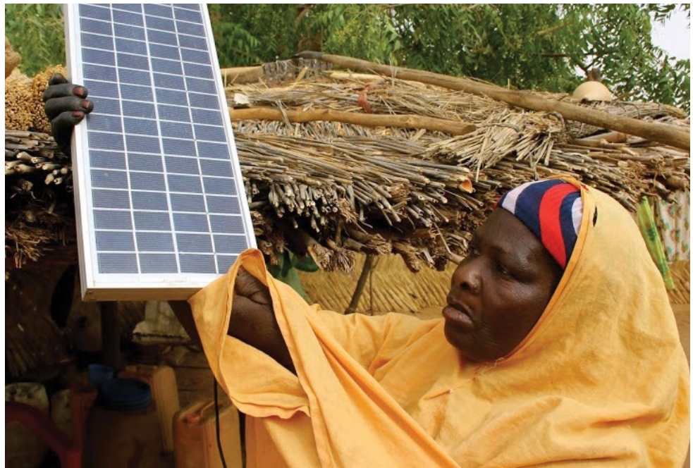
Installing a solar panel, Niger