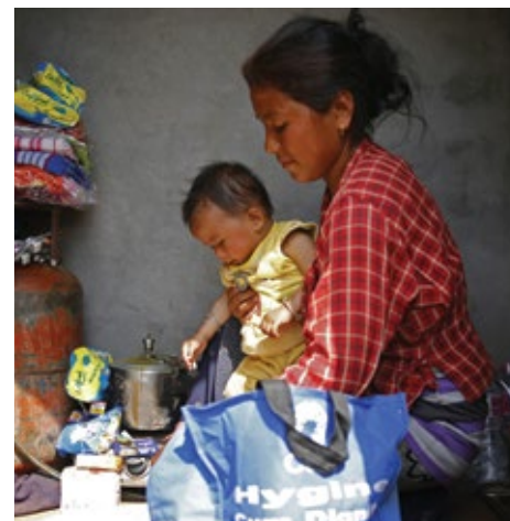
Emergency kits in Paslang Village, Nepal

people in 2015 through its humanitarian response.